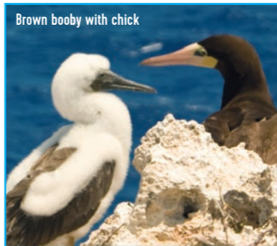
Brown booby with chick

FOR BIRDWATCHERS , Cayman Brac has almost 200 species of birds, including the endangered Cayman Brac parrot, with a population of only 350. Look for parrots on the north coast and in its protected woodland reserve on the bluff, and keep an eye out for the