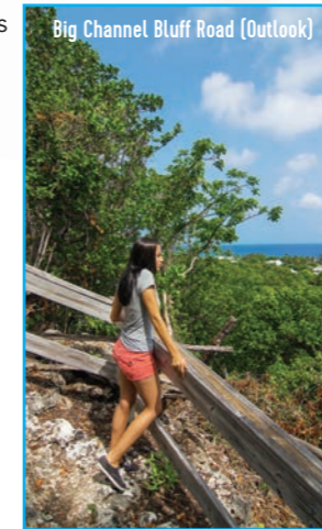
Big Channel Bluff Road (Outlook)

FOR BIRDWATCHERS , Cayman Brac has almost 200 species of birds, including the endangered Cayman Brac parrot, with a population of only 350. Look for parrots on the north coast and in its protected woodland reserve on the bluff, and keep an eye out for the