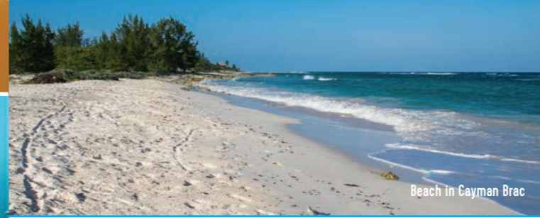
Beach in Cayman Brac

Cayman Brac welcomes you and encourages you to explore our exciting and beautiful island. Come to where natural and cultural heritage remain closely interwoven. You will find a safe, peaceful environment for walking, hiking, biking, taking leisurely drives or just relaxing in blissful solitude.